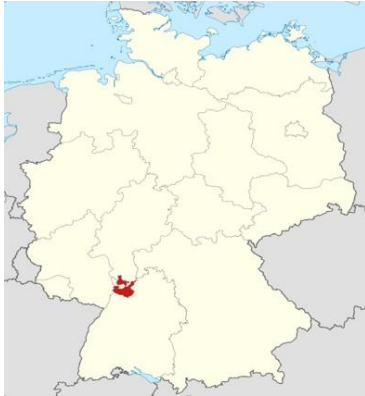
Germany and the Rhine-Neckar Metropolitan Area in the southwest