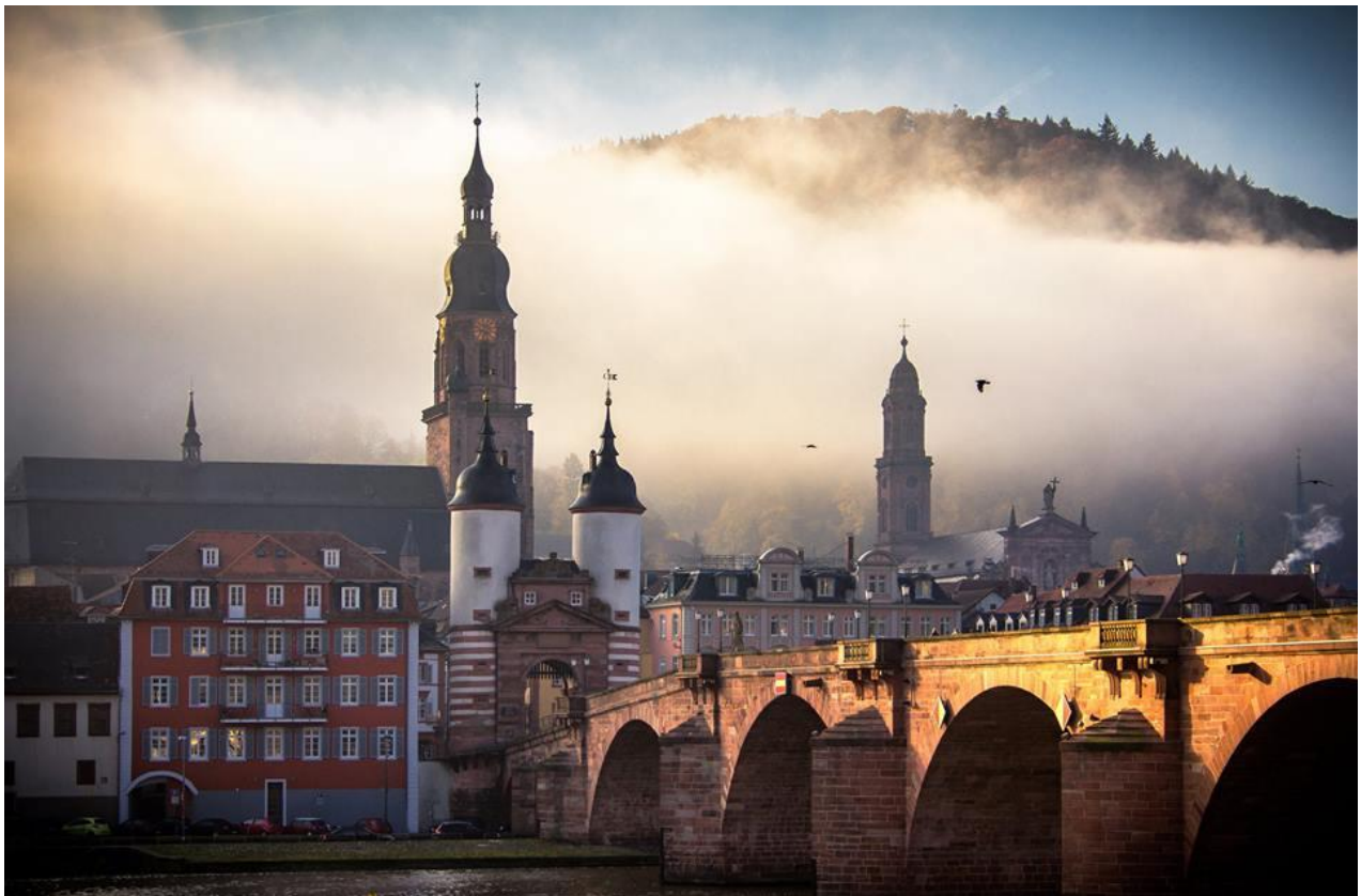
Heidelberg's "Old Bridge"

The City of Heidelberg: “Capital for Environment and Nature” – an award-winning “Sustainable European Model City”